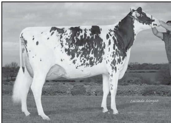
WHINCHAT DEALMAKER FLO 2 (VG-88) Twin sister to dam of lot 280 Sold for 5,000gs Whinchat Sale 2022

She is maternal sister to the 10,869kg 4.62% (3.32) Whinchat Shottle Flo 4 (Ex-91-2, SP) and to the 12,146kg 3.74% (3.25) Whinchat Douglas Flo (VG-85, SP). Her dam was the 12,950kg 4.12% (3.26) Whinchat Allen Flo 2 (Ex-93-2, SP, LP70 5*); gd was the 11,151kg 4.02% (3.22) Whinchat Gibson Flo (Ex-92, SP); 3d was the 11,552kg 4.35% (3.23) Whinchat Silver Flo ET (Ex-93-4, SP, LP70); 4d was the 10,285kg Huddlesford Astre Flo ET (VG-87), purchased for 3,000gs Huddlesford Sale 1997; 5d was the prizewinning 16,085kg 3.97% (3.28) Cardsland Eclipse Flo (Ex-96-2, SP, RSI 25*) EC that won numerous Interbreed Championships including Supreme Interbreed Dairy Champion RASE Shows 1992 & 1995 and Supreme Interbreed Champion DFE 1994 and was sold for 30,000gs Huddlesford Sale 1997.