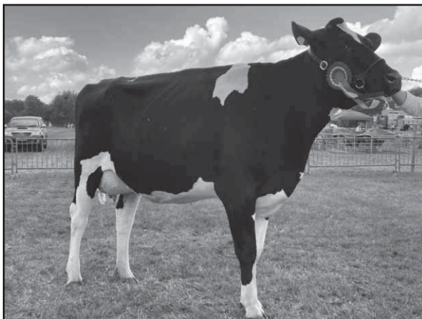
CREW HILL HR P ANTOINETTE (VG-86), lot 135