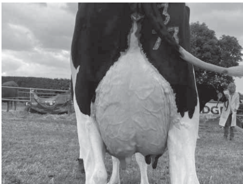
CREW HILL CARLOS BETTY (VG-86) Lot 65

Her dam was the 8,716kg 4.00% Crew Hill JPM Fred Betty 2 (VG-86); gd was the 8,767kg 4.72% (3.36) Crew Hill Raider Betty.